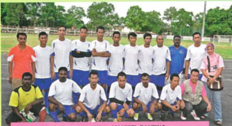
2ND RUNNER UP - AMSTEEL BANTING