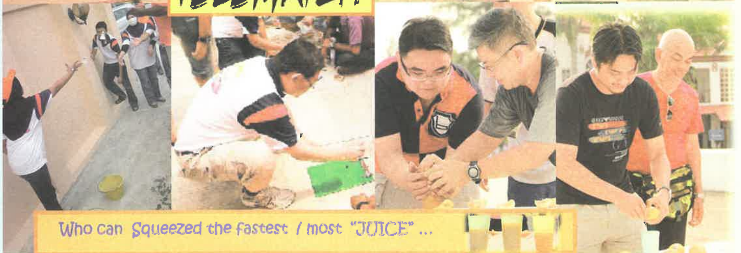
Who can Squeezed the fastest / most "JUICE" ...