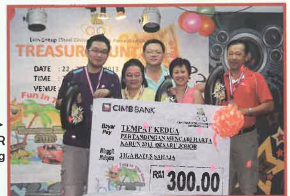
2 nd Placing -▶ CITY HUNTER Amsteel Klang