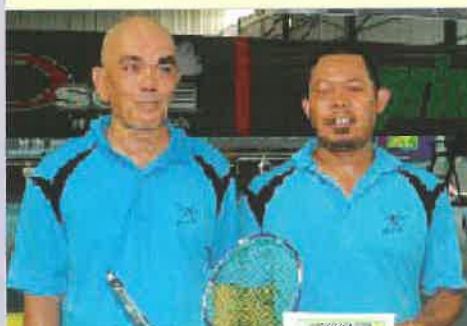
BRIGHT STEEL 4