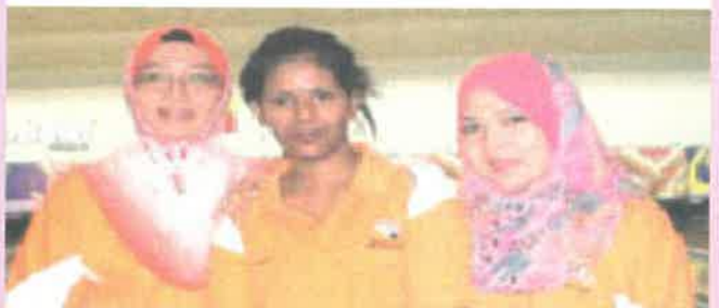
1st Runner Up - Amsteel Klang B