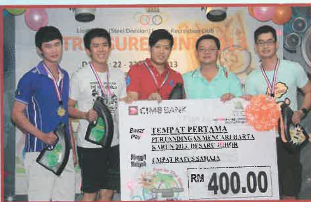
◀ 1 st Placing - BANANA CHERRY Amsteel Klang