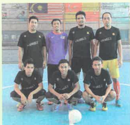
1st Runner Up – Amsteel Klang A