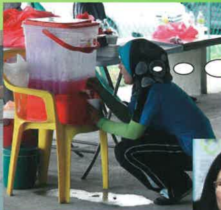
Hmm.. Nasib baik tak de orang nampak I