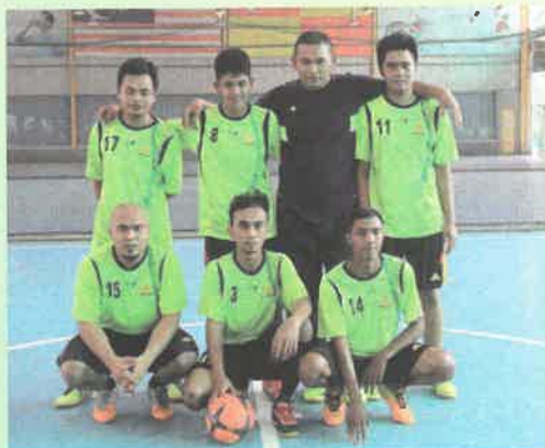
Champion – Megasteel A