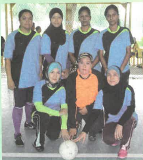
Champion - Amsteel Klang