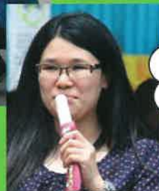
Hmm.. Sedapnya ais krim