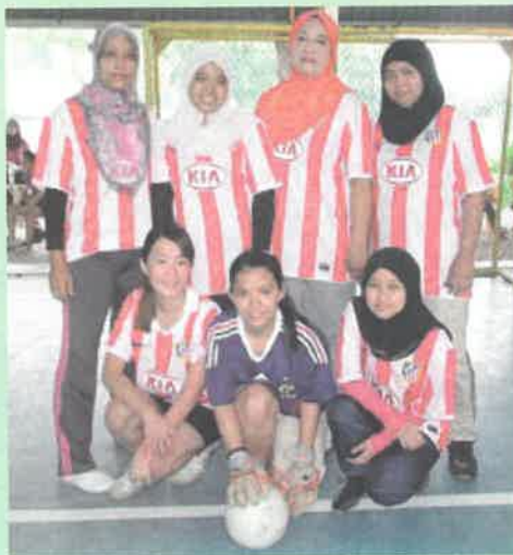
2nd Runner Up - Amsteel Banting