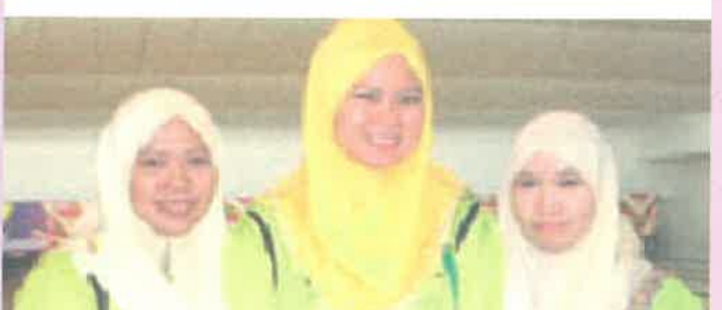
2nd Runner Up - Megasteel B