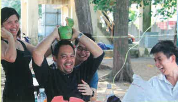
Haa! Haa! Look at him...see who is he trying to imitate