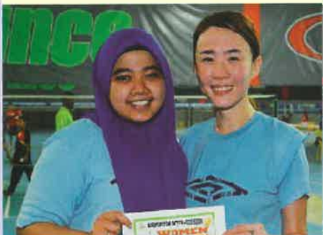
AMSTEEL BANTING 4