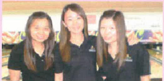
CHAMPION - Amsteel Banting A