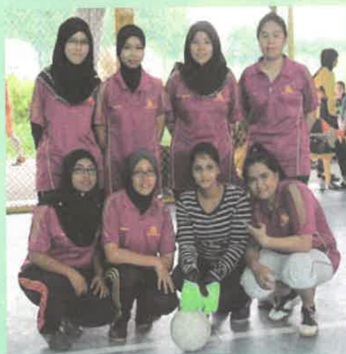
1st Runner Up - Megasteel