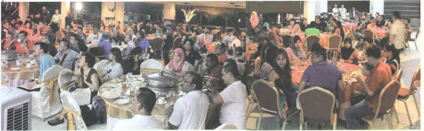
Participants waiting anxiously for the Hunt's results