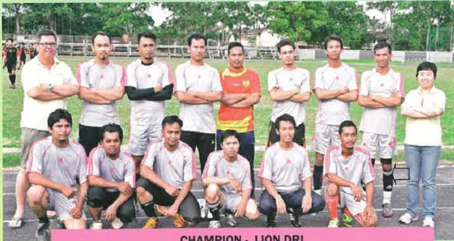
CHAMPION - LION DRI

20 April 2013, Football League was held at Stadium Jugra, Banting with 6 teams taking part in the league.