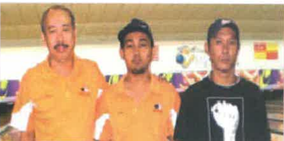
2nd Runner Up - Amsteel Klang B