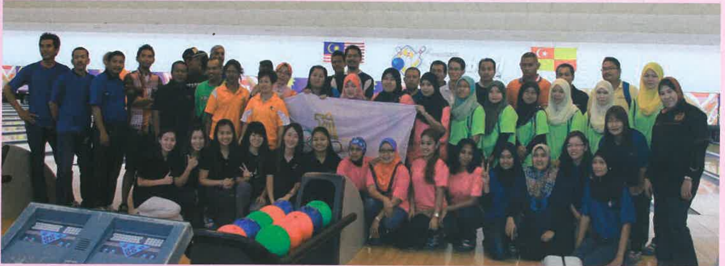
19 May 2013, The Inter Companies Bowling Competition was held at Ampang SuperBowl @ The Summit USJ, Selangor