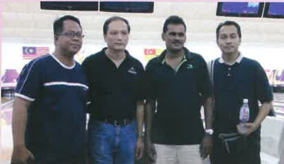
CHAMPION - Megasteel B