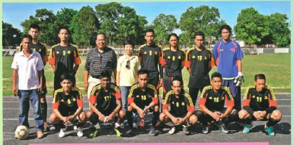
1ST RUNNER UP - MEGASTEEL

Talent wins games, But teamwork and intelligence Win Championships