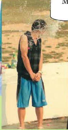
Meow..meow. Apa you buat kat sini