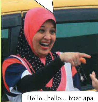
Hello...hello... buat apa kat situ