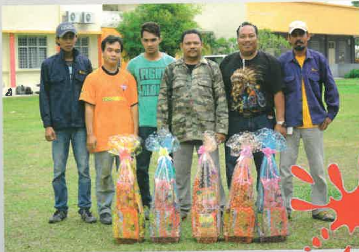
1st RUNNER UP - BRIGHTFIGHTER (Bright Steel)