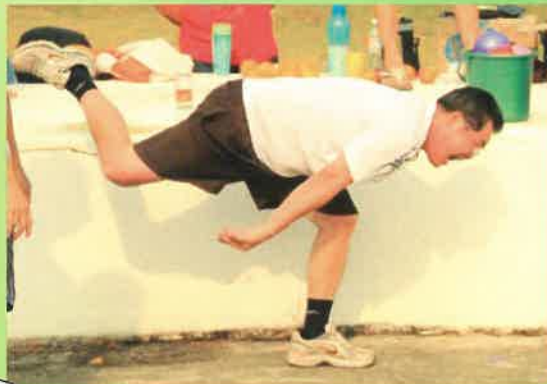
$$$ falling from the sky