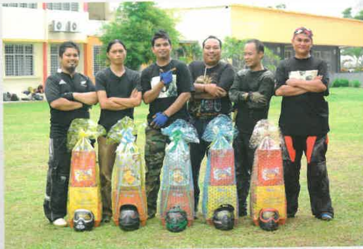
CHAMPION - ATOMIC (Megasteel)

Inter-Division Paintball Competition was held on 27 October 2013 at Kolej Komuniti Banting with a total of 16 teams taking part in the Competition. The winners are :-