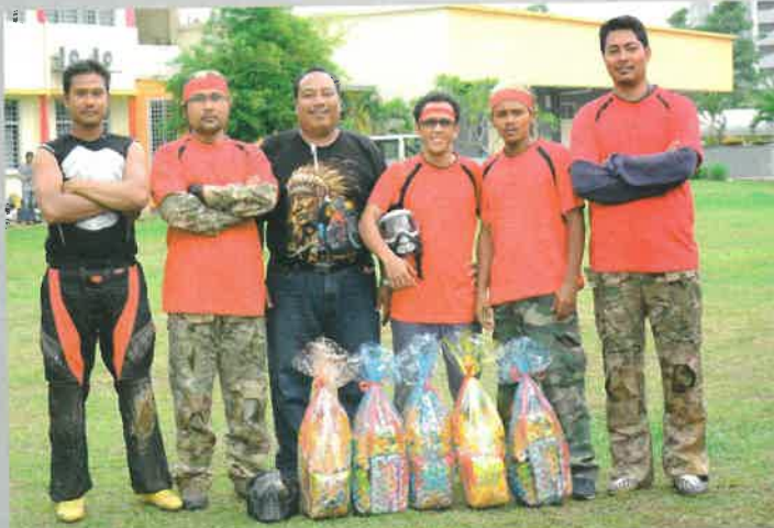
2nd RUNNER UP - DYESECTED (Megasteel)