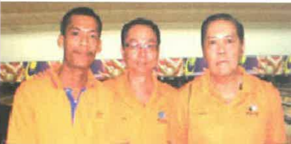
1st Runner Up - Amsteel Klang A