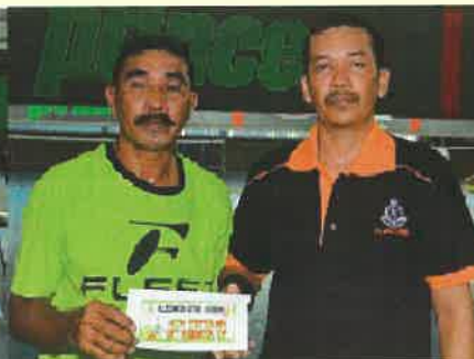
LION STEELWORKS 1