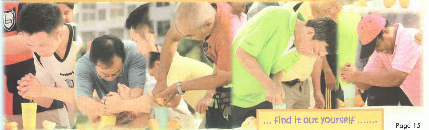
... find it out yourself .....